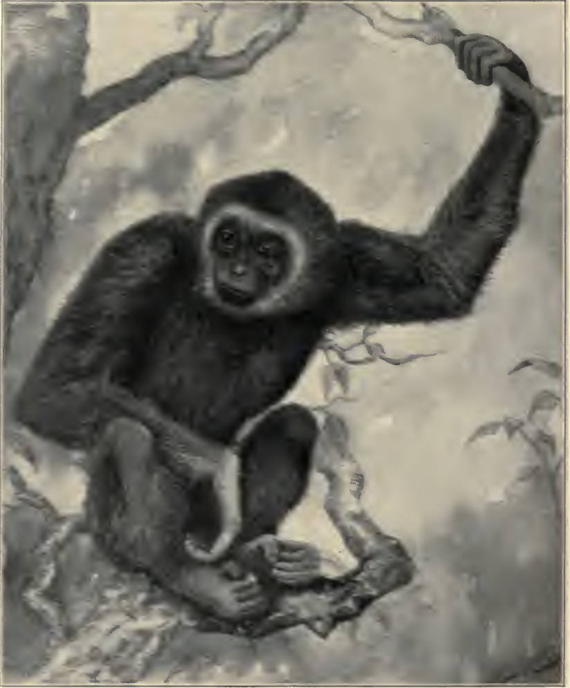
FIG. XCI. HYLOBATES LAR. GIBBON.